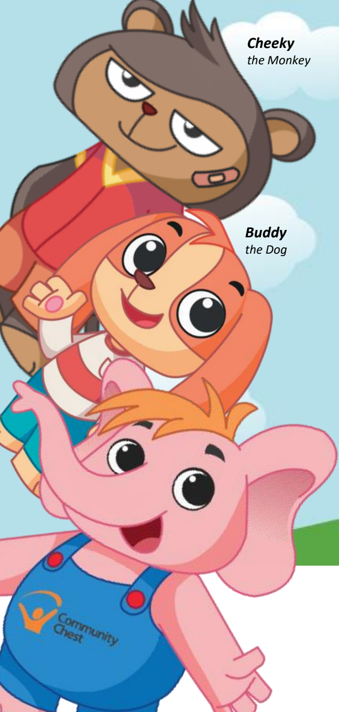
Cheeky the Monkey