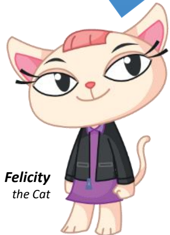
Felicity the Cat

Activity ideas/resources will be provided.