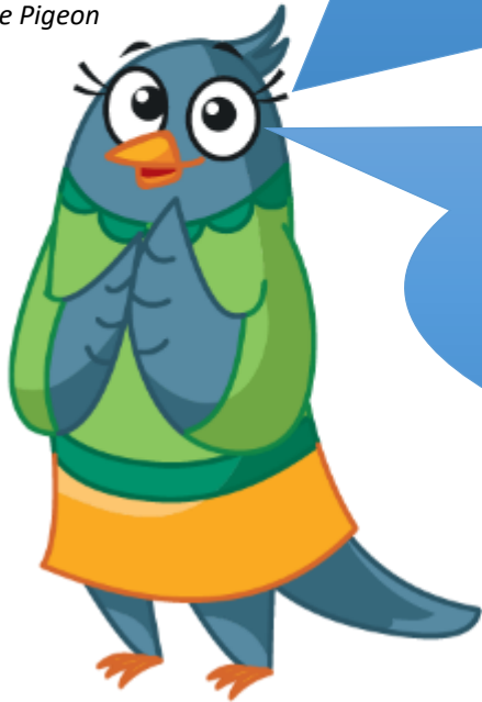
Flappy the Pigeon

We will be seeking feedback from preschools on the information provided in the e-infokit and ways that the teachers' and preschoolers' experiences can be improved. Your centre may also be approached to submit photos or videos to showcase your activities!