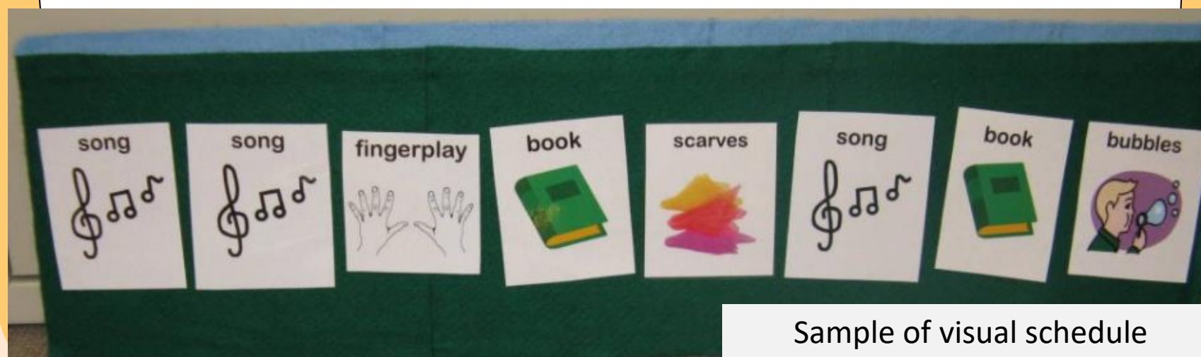
Sample of visual schedule