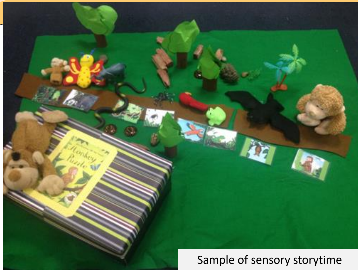
Sample of sensory storytime