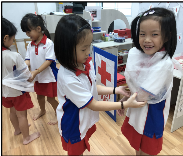
RED CROSS JUNIORS