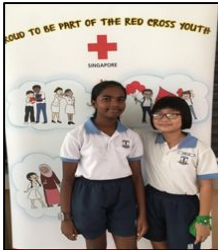
RED CROSS LINKS