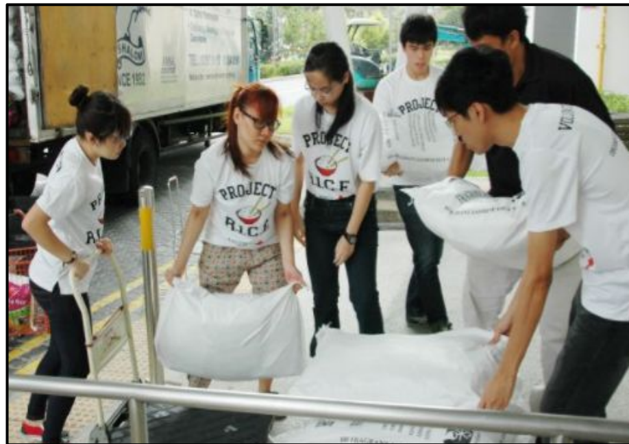
RED CROSS CHAPTERS