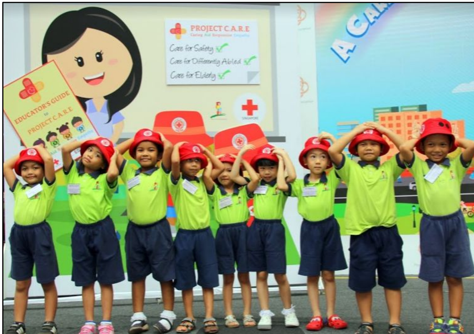
First 7 RCJ Clubs with Kidz Meadow