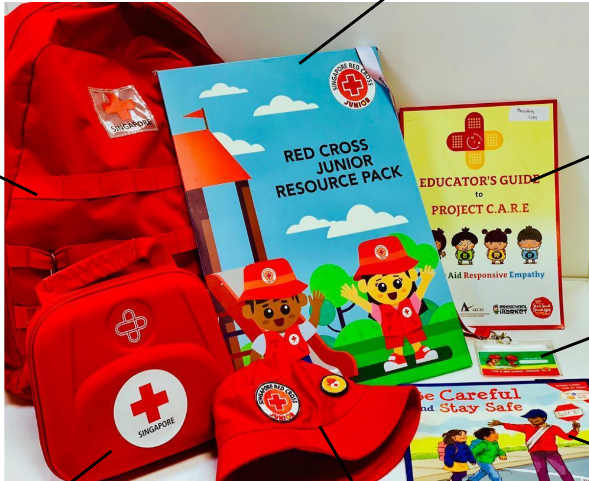
"Get on the Go" (GOTG) Bag