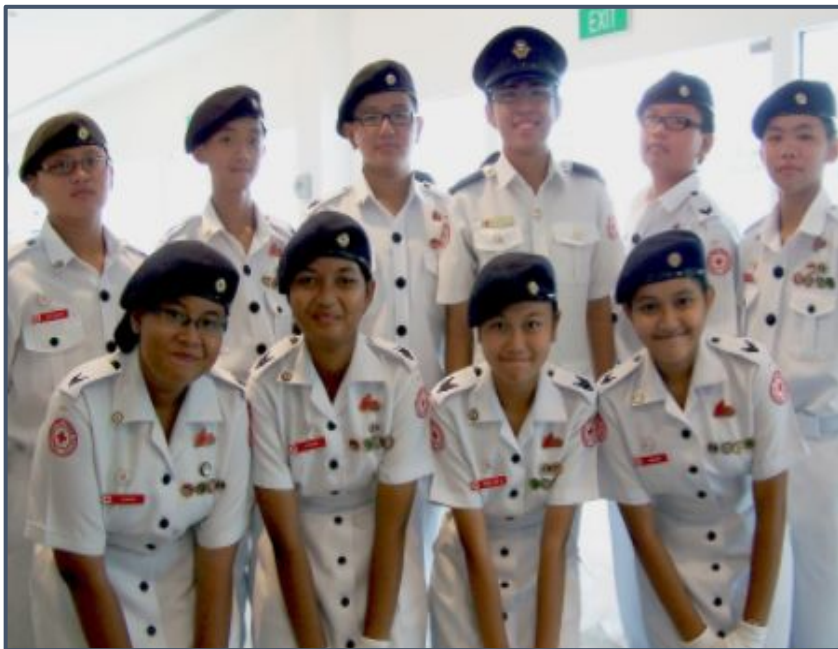
RED CROSS CADETS