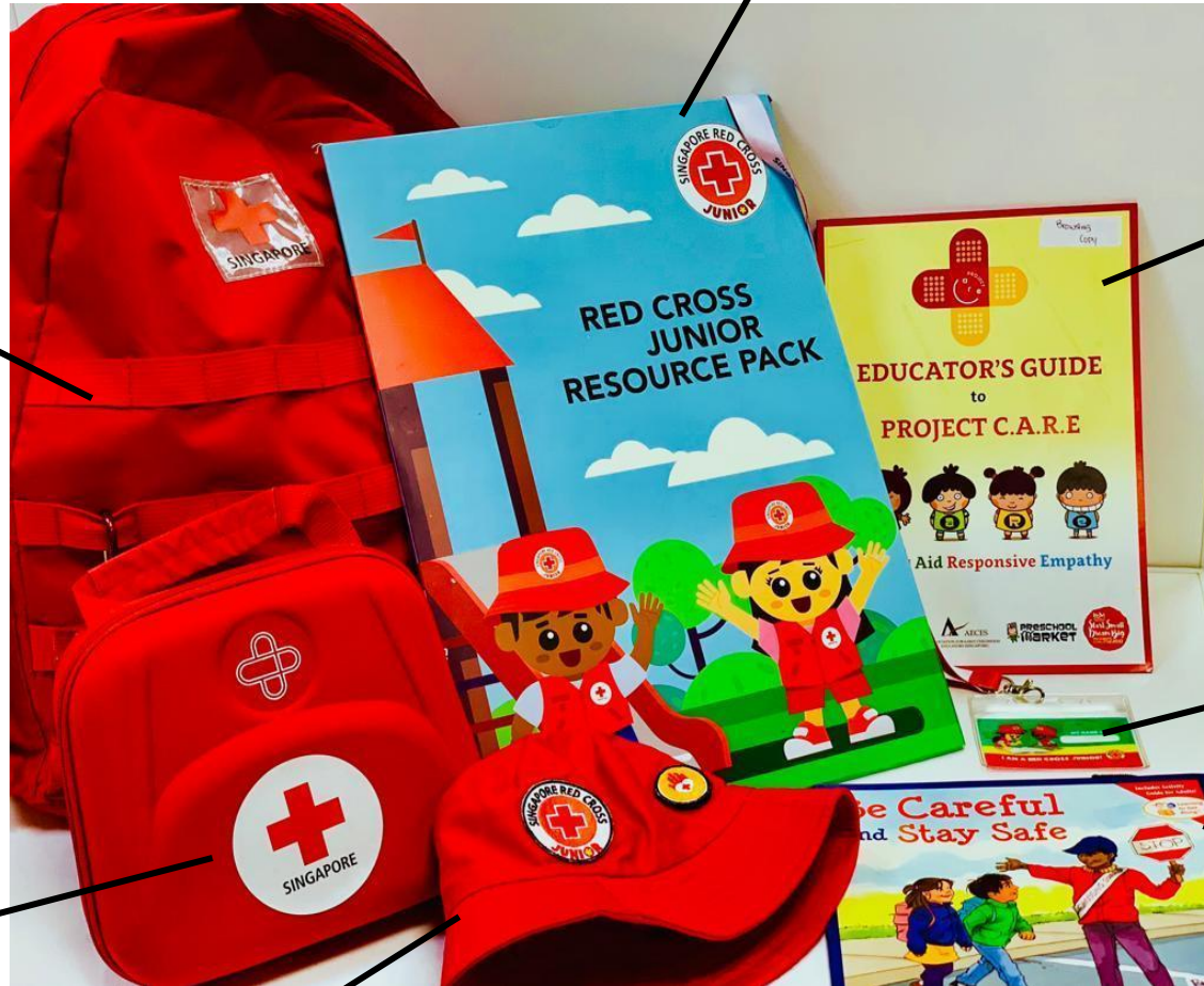
"Get on the Go " (GOTG) Bag