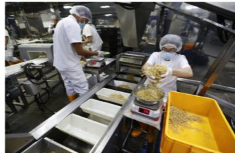
The new Singapore Food Agency will address all food-related issues, from food production to food hygiene.

New agency launched to strengthen food security and safety, from farm to fork