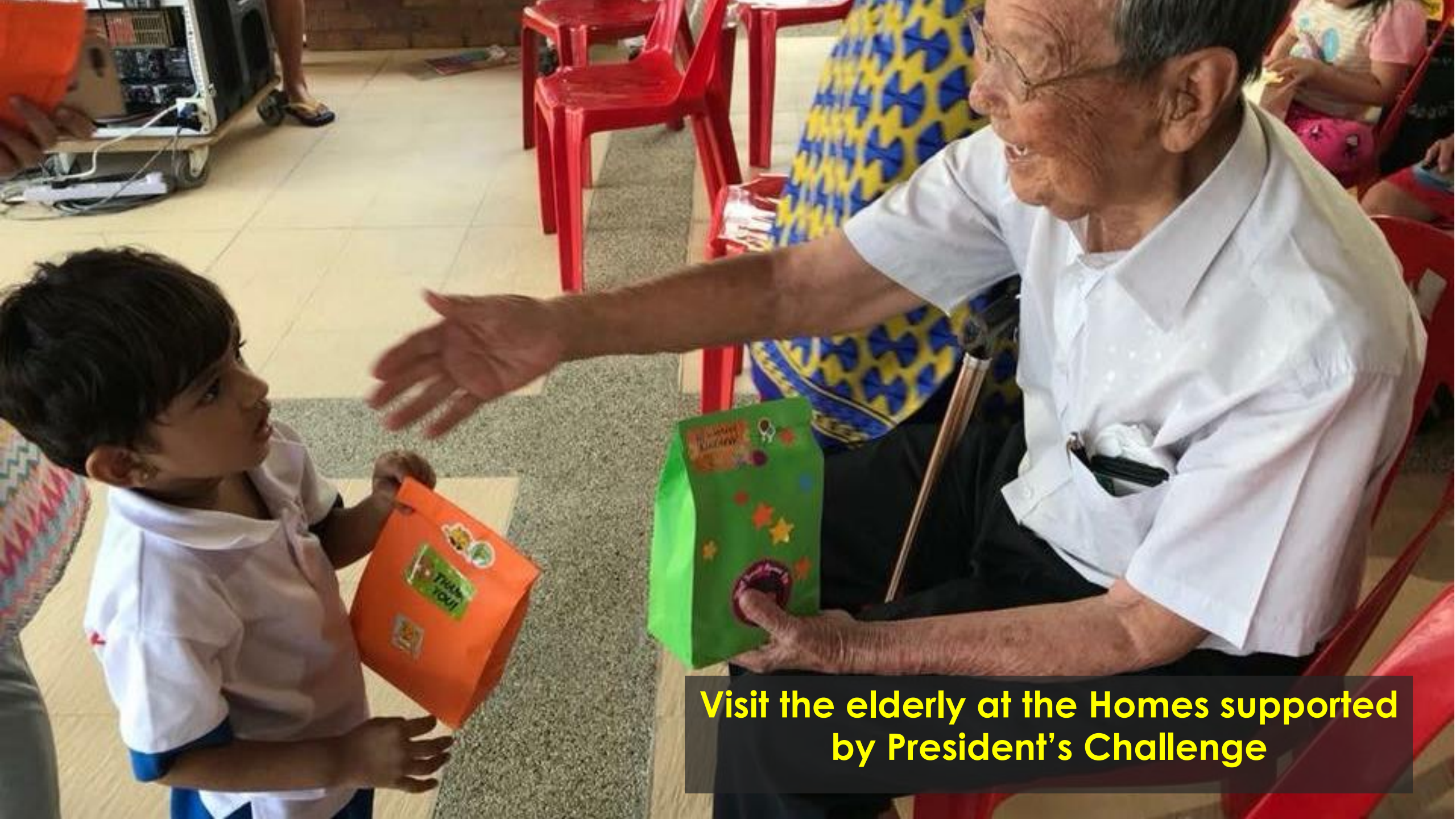
Visit the elderly at the Homes supported by President's Challenge