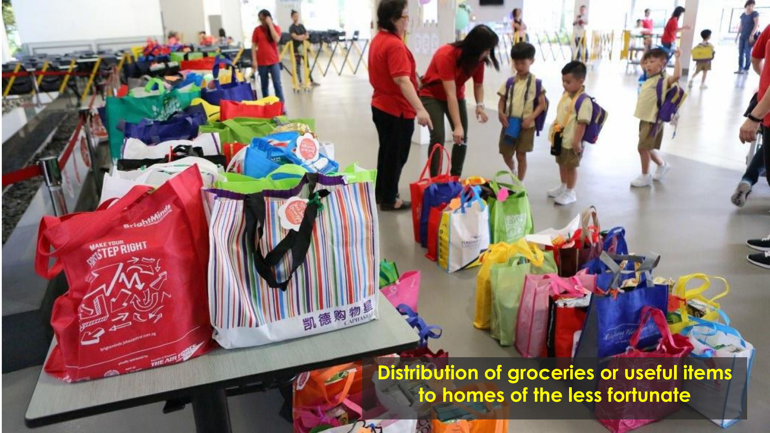
Distribution of groceries or useful items to homes of the less fortunate